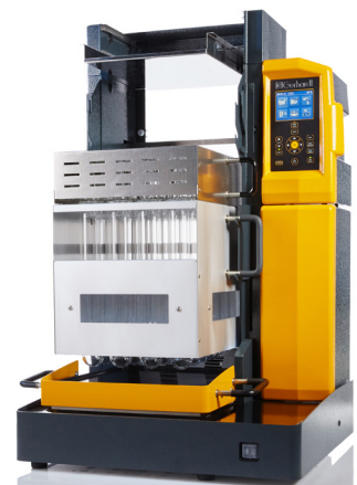
KT-L 20s with installed KT Eco Kit