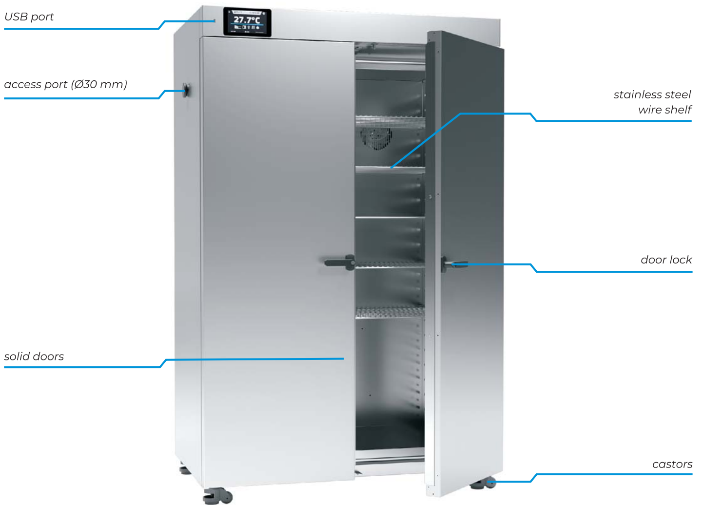
Drying oven SLW 1000 IG Smart PRO

Drying ovens are designed to provide high temperatures up to 300°C